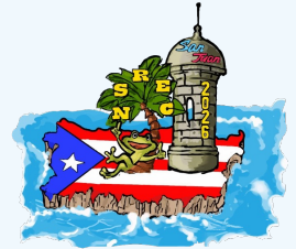
Exhibit Entrance Display – Two Tower